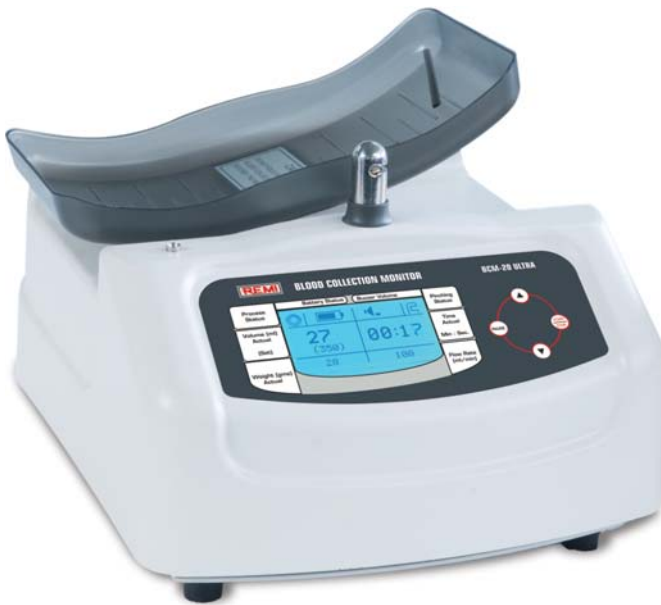
BCM 20 Ultra

REMI BCM-20 Ultra, Next generation blood collection monitor with interactive multicolor LCD display. Helps technicians to follow the SOP's ensuring standardization of the collection process